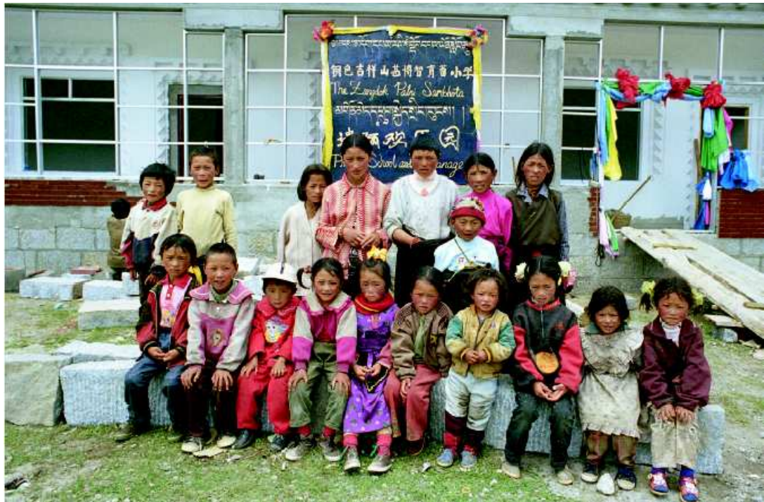
Figure 6: school inauguration, first pupils