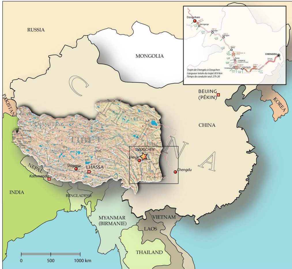
Figure 1: Dzogchen region

The Dzogchen region is situated at an altitude of 4 000 m on the high Himalayan plateaux, in the region of Kham, which is currently part of the Chinese province of Sichuan.