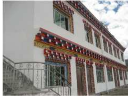
Figure 7: 2005, building with teachers' quarters