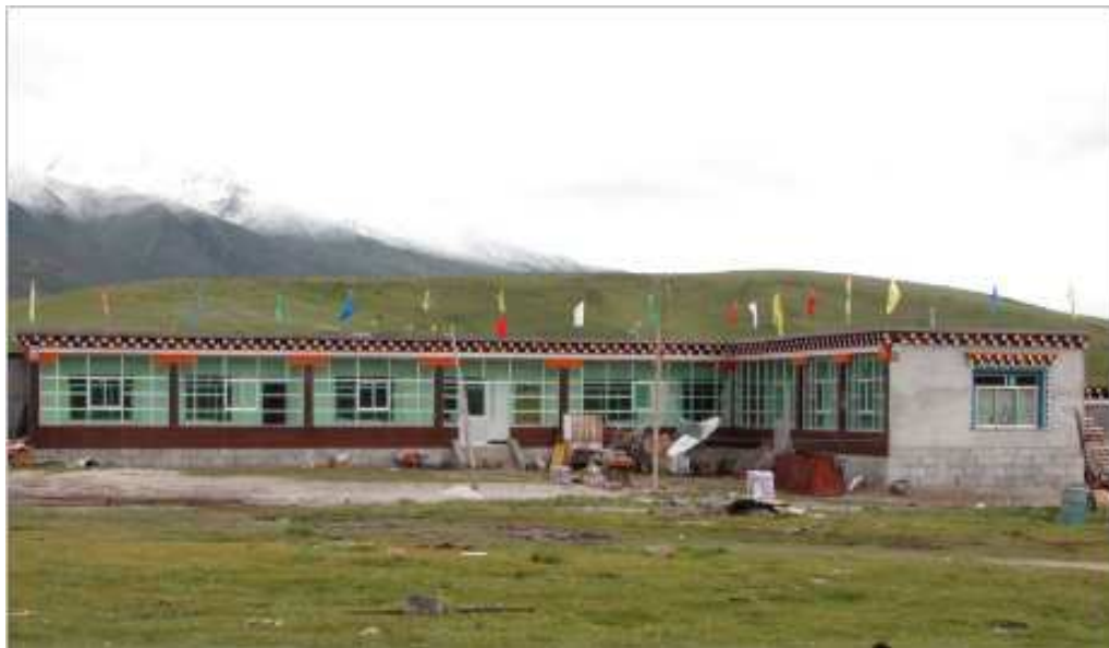
Figure 4: the school opened in Augustus 2002

The school library was funded by the Swedish Tibetan Society for School and Culture, a Swedish NGO already responsible for the construction or renovation of 108 schools throughout Tibet ( www.tibet-school.org )