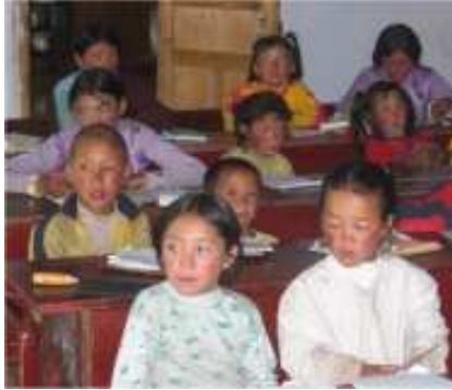
Figure 8: Pupils

Tel: +32 02 732 89 86 Fax: +32 02 732 89 87 Email: info@zangdokpalri.net www.zangdokpalri.net ING: 310-1469277-07