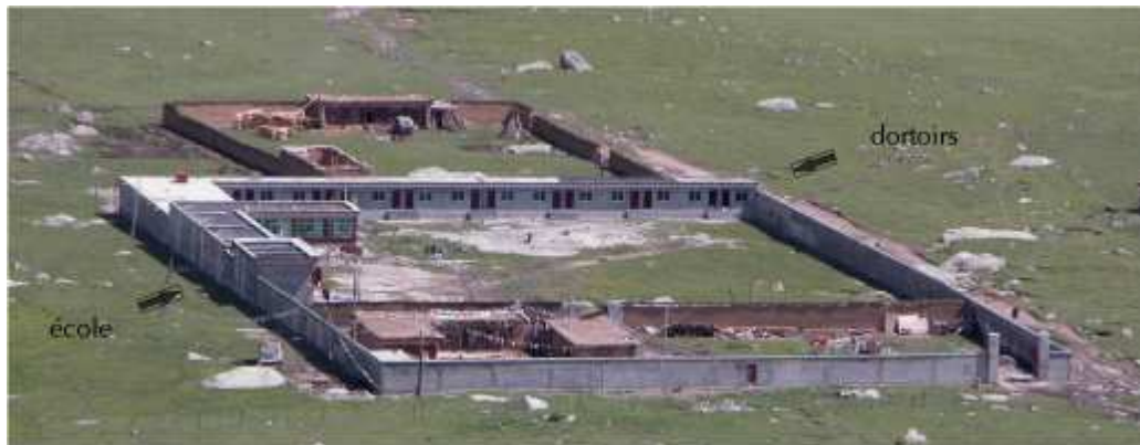
Figure 5: View of the school and dormitory in 2003