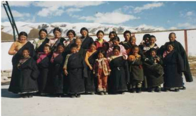
Figure 9 : Pupils