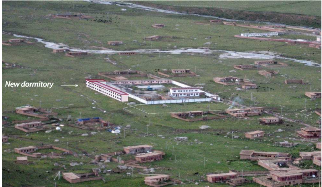
Figure 2: Location of the school with projected expansion